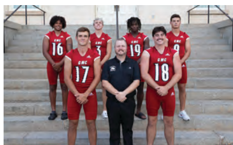
COACH READY Quarterbacks